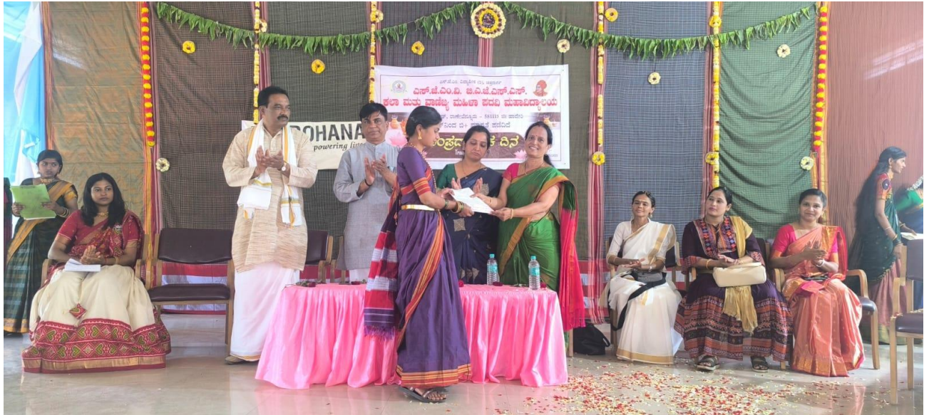
SRI.SITARAM JINDAL SCHOLARSHIP DISTRIBUTION TO STUDENTS.