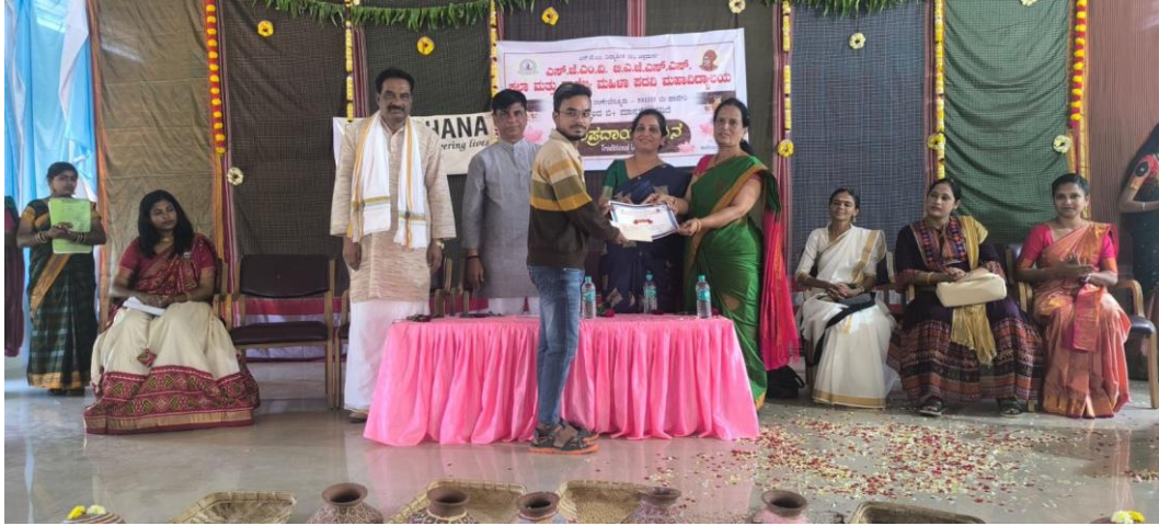
STATE LEVEL DEBATE AND ESSAY COMPETITION PRIZE DISTRIBUTION TO STUDENTS.